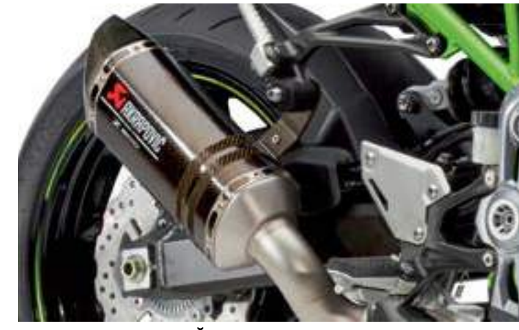
CARBON AKRAPOVIČ EXHAUST