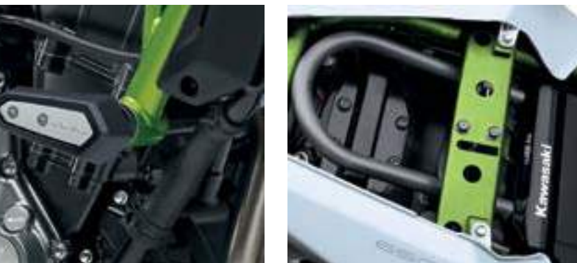
U-LOCK AND BRACKET