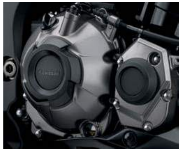
CLUTCH COVER GUARD