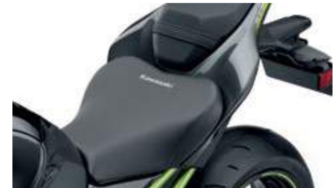
25 MM HIGHER ERGO-FIT SEAT