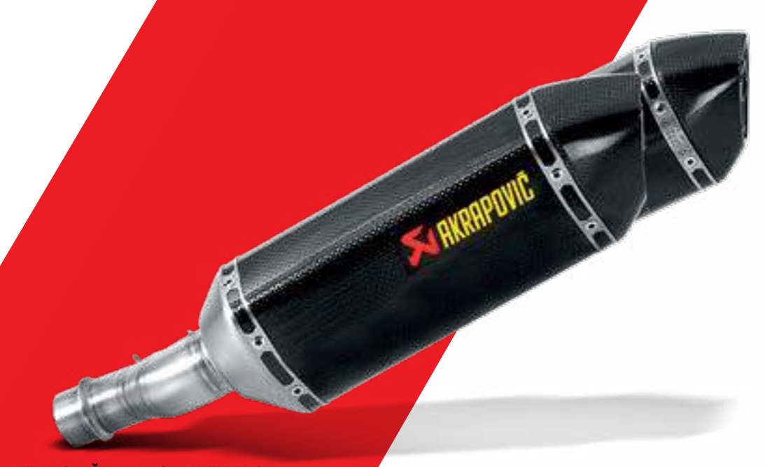
CARBON AKRAPOVIČ EXHAUST MUFFLERS