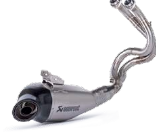
AKRAPOVIČ SPORTS EXHAUST