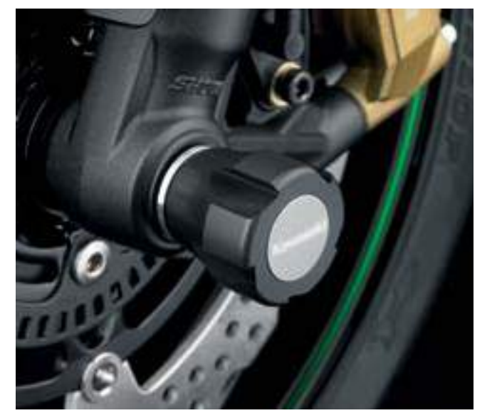
FRONT AXLE SLIDERS