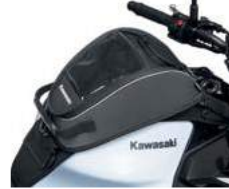
TANK BAG WITH WINDOW (4L)