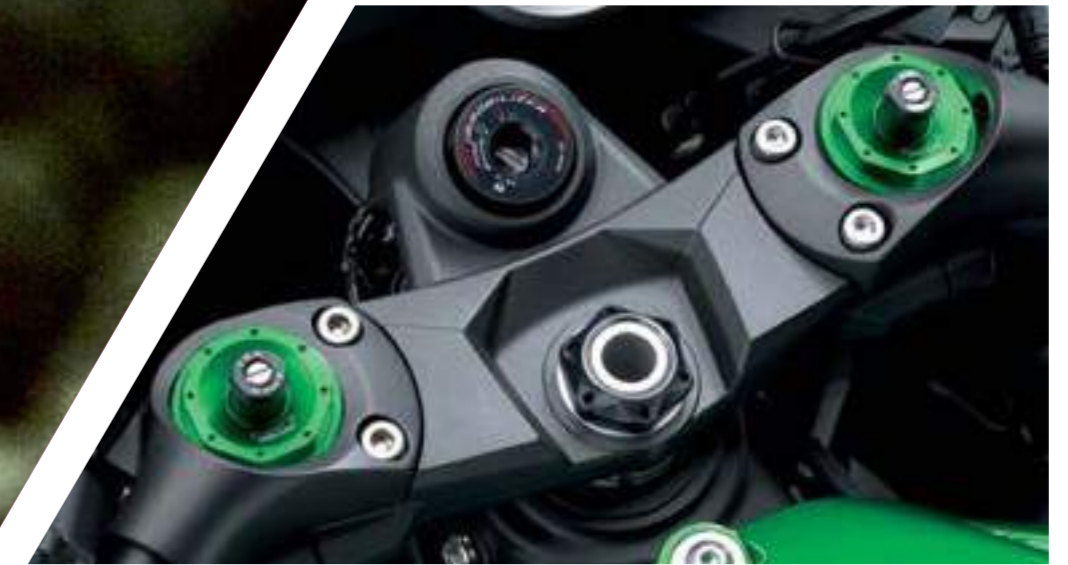
FULLY ADJUSTABLE 43 MM INVERTED FORKS.*

A two-wheeled force of nature, the ZZR1400 offers a blend of sheer horsepower and reassuring torque.