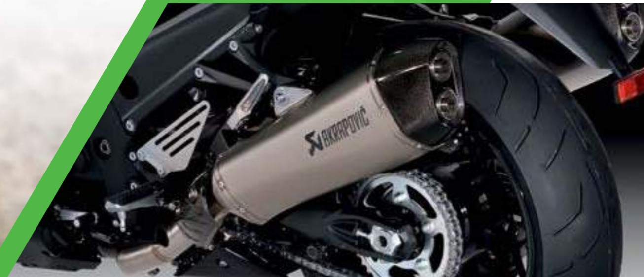
AKRAPOVIČ TITANIUM SILENCERS

No need to suppress the urge for adventure. Riding solo or with passenger, there is a great range of items custom designed for the ZZR1400.