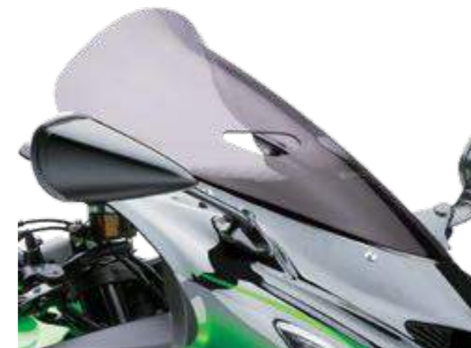
SMOKED SPOILER SCREEN