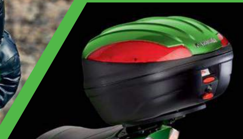
47L COLOUR CODED TOP CASE