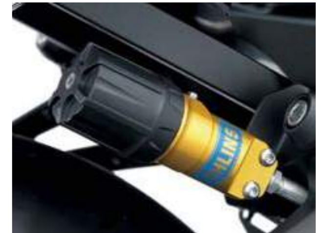
ÖHLINS TTX39 REAR SHOCK WITH PIGGYBACK RESERVOIR AND REMOTE PRELOAD ADJUSTER.*