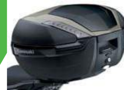
47L TOP CASE