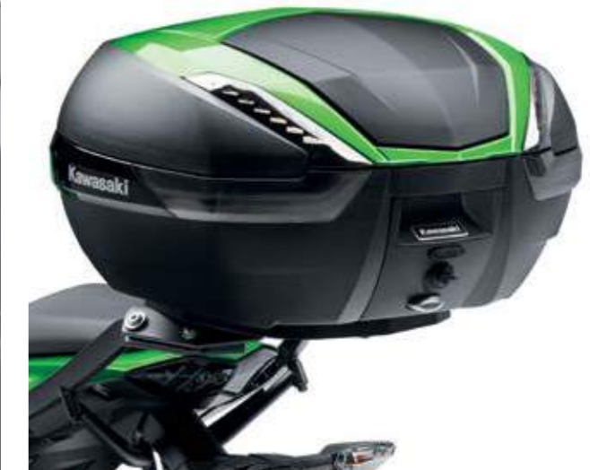
47L COLOUR CODED ONE KEY TOP CASE