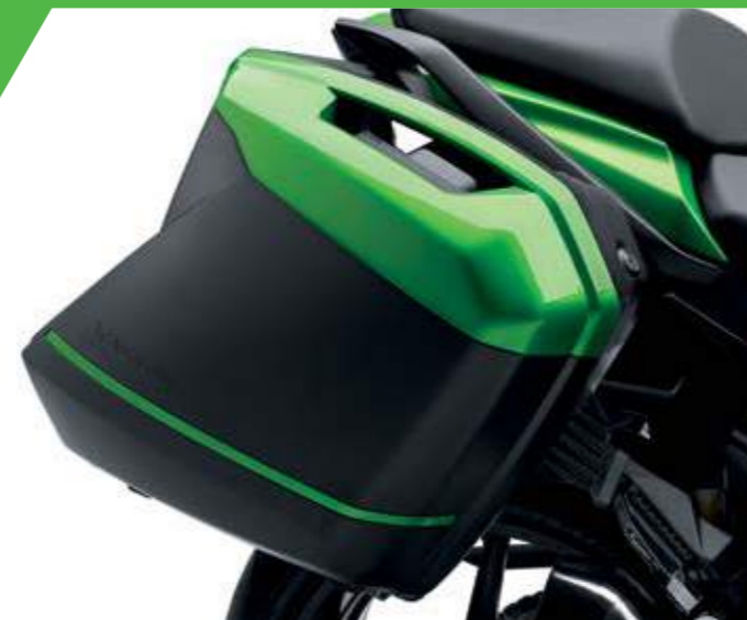
56L COLOUR CODED ONE KEY PANNIER SYSTEM