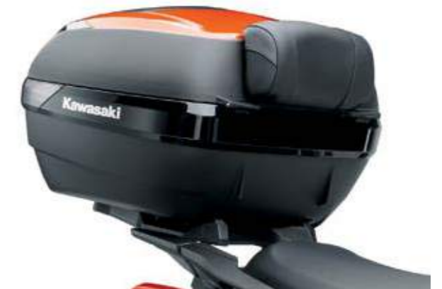
47L COLOUR CODED, ONE KEY TOP CASE SYSTEM