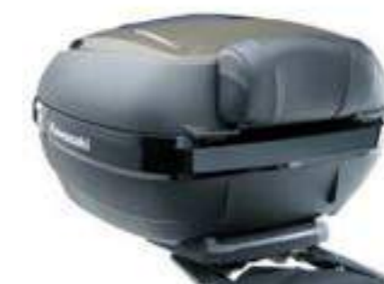
PILLION BACK REST