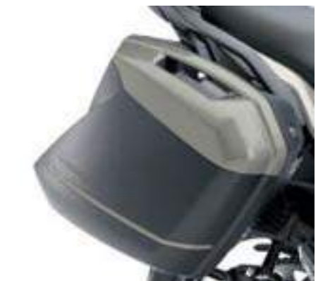
56L PANNIER SYSTEM