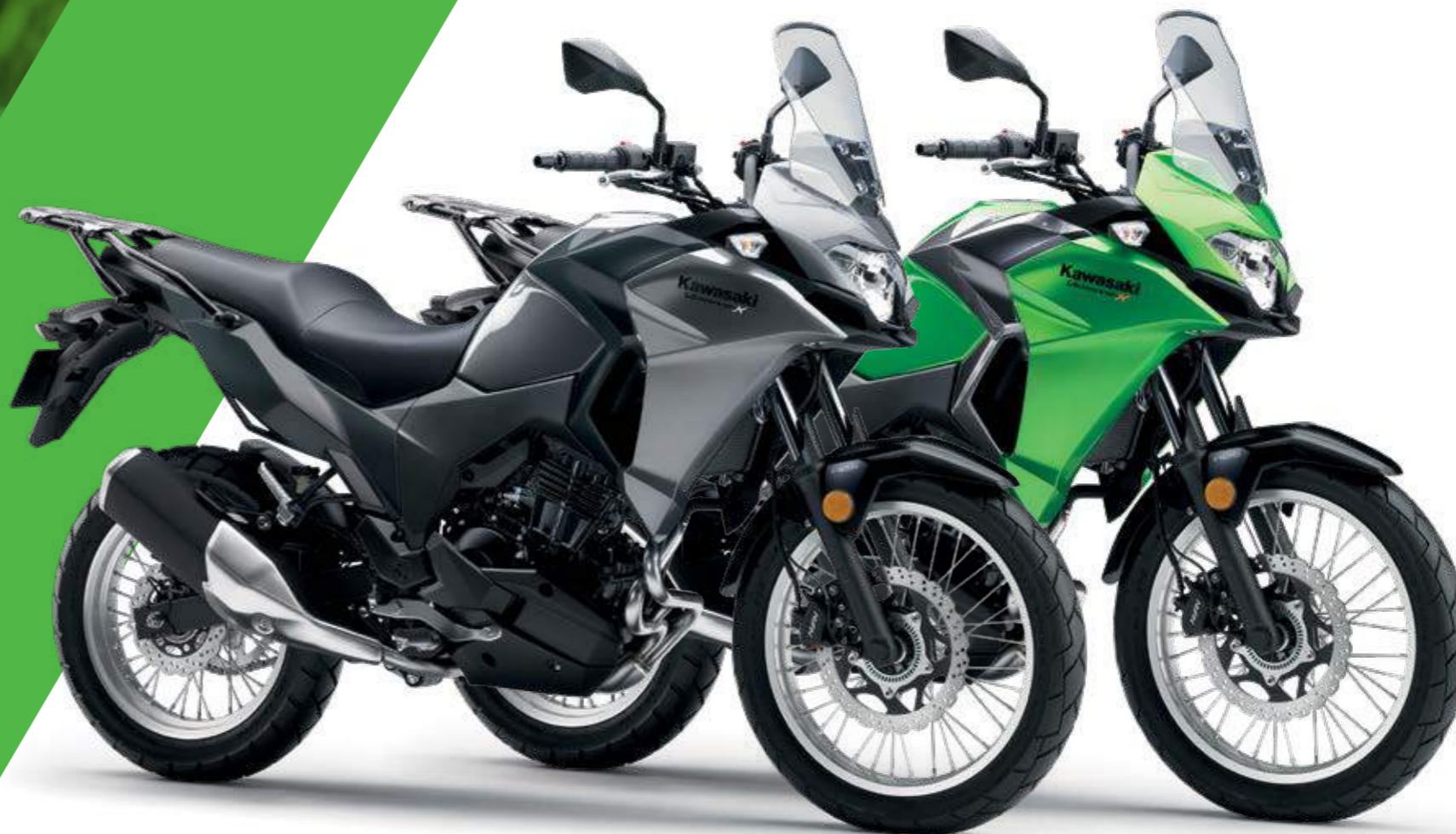
METALLIC GRAPHITE GRAY