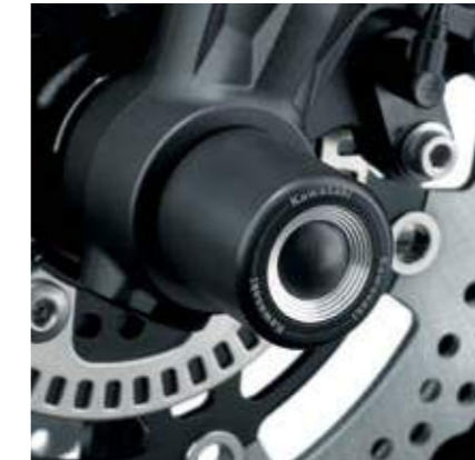
FRONT AXLE SLIDERS