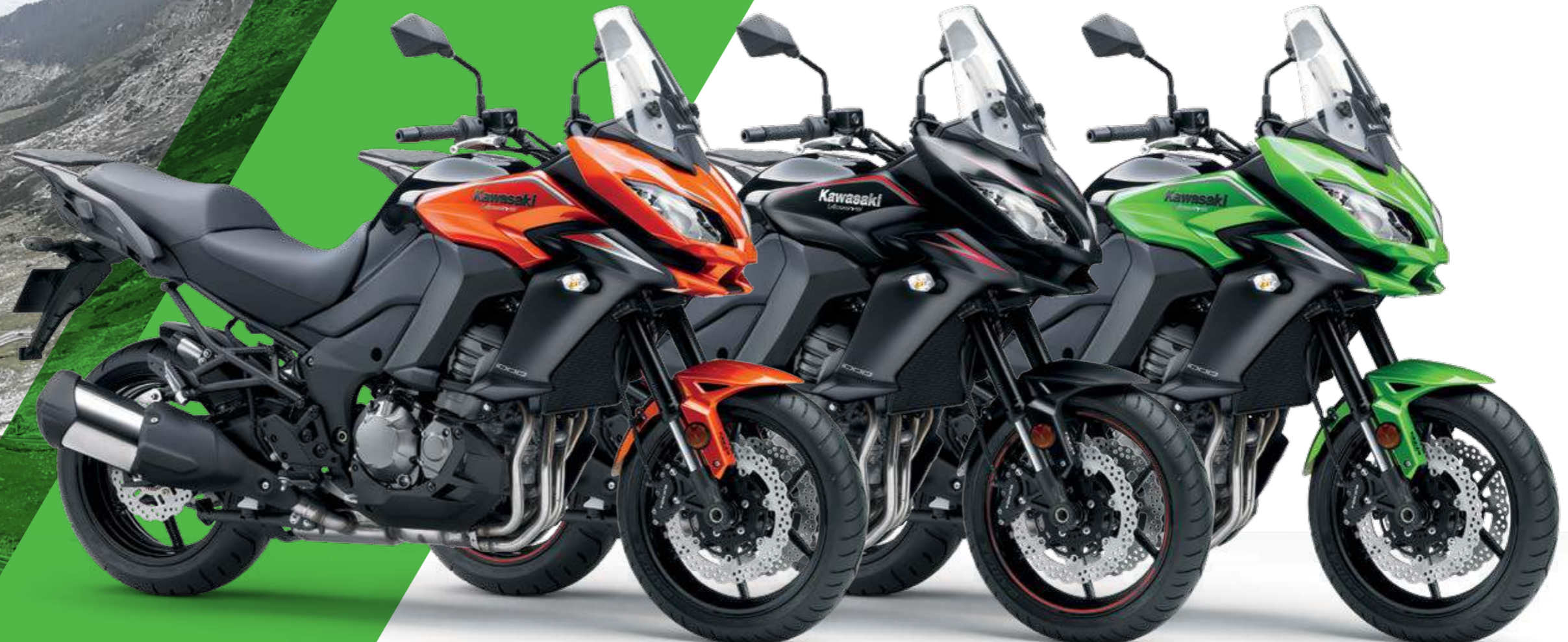
CANDY BURNT ORANGE / METALLIC FLAT SPARK BLACK