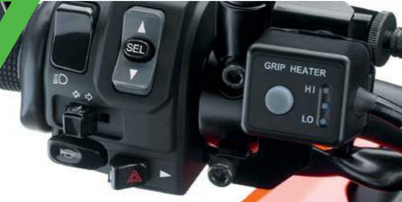
3-MODE GRIP HEATER