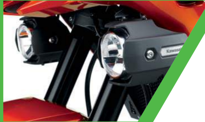
LED FOG LAMPS