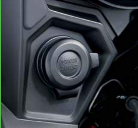
12V POWER OUTLET