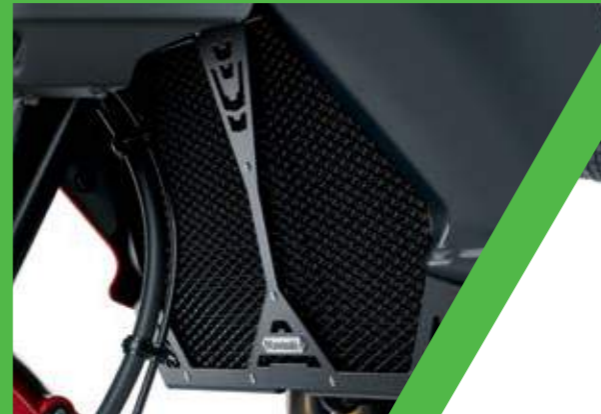
RADIATOR CORE GUARD