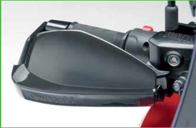
INJECTION MOULDED HANDGUARDS