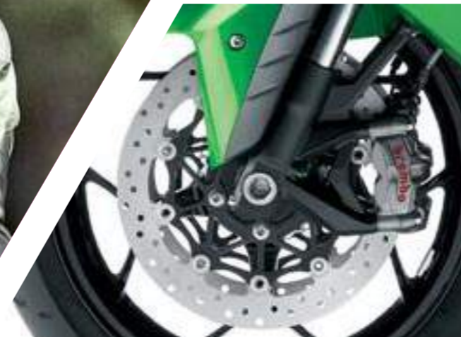
BREMBO M50 CALIPERS AND BREMBO DISCS.*