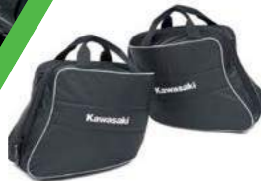
INNER BAGS FOR PANNIERS