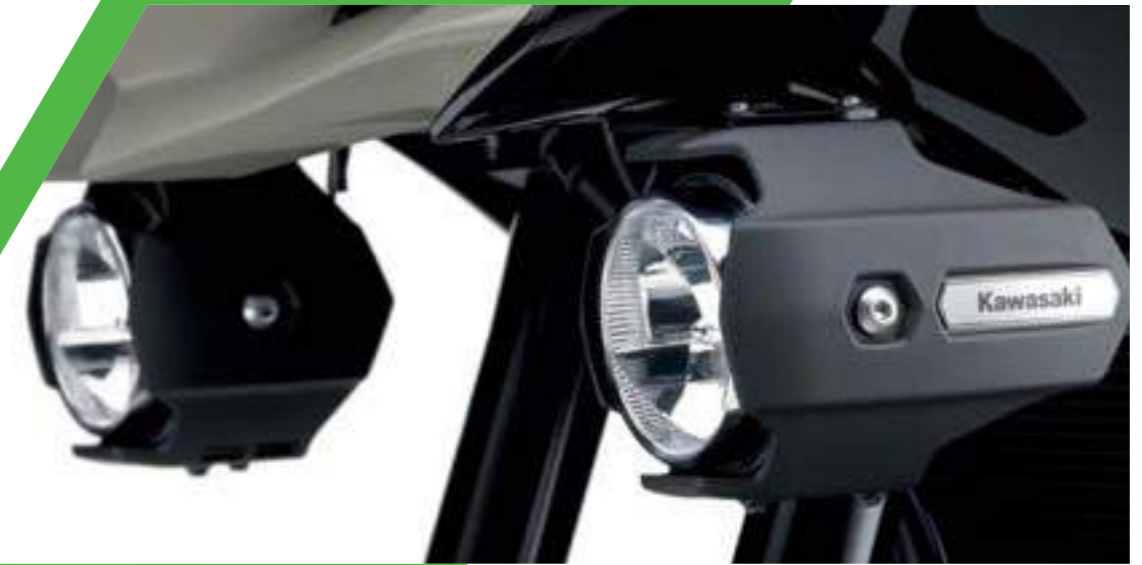
LED FOG LAMPS