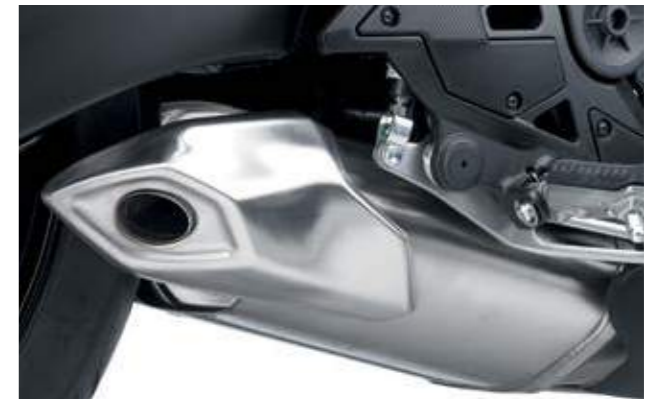
STYLISH UNDERNEATH EXHAUST