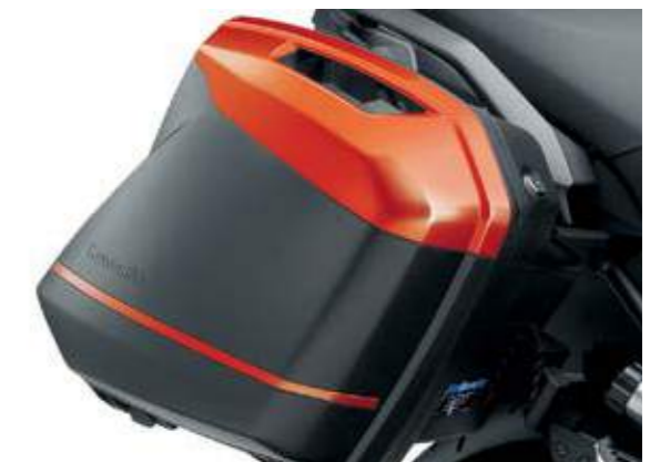
56L COLOUR CODED, ONE-KEY PANNIER SYSTEM