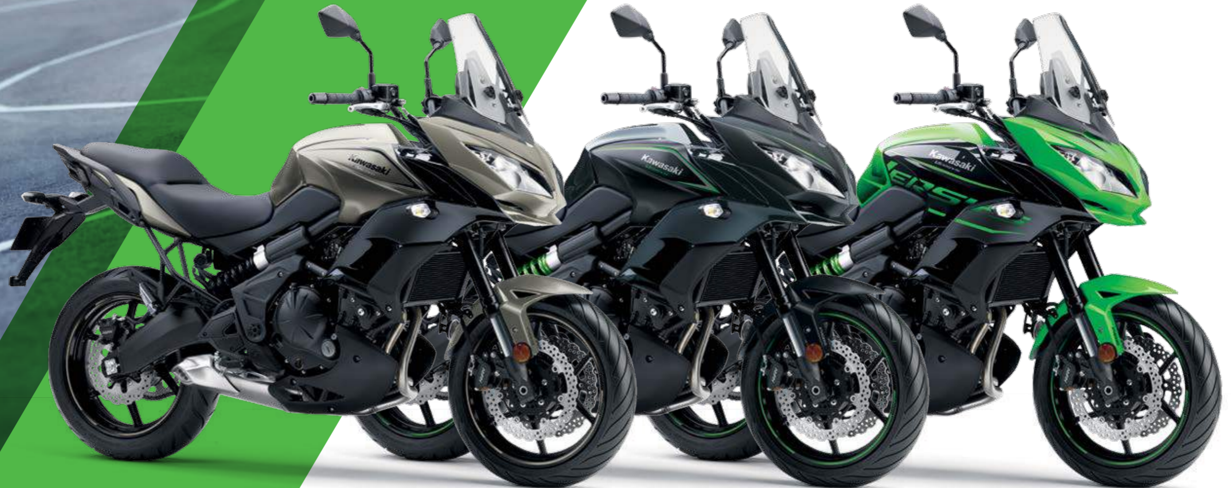
METALLIC FLAT RAW TITANIUM