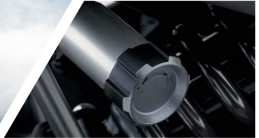
OFFSET LAYDOWN SINGLE-SHOCK WITH REMOTE PRELOAD ADJUSTER