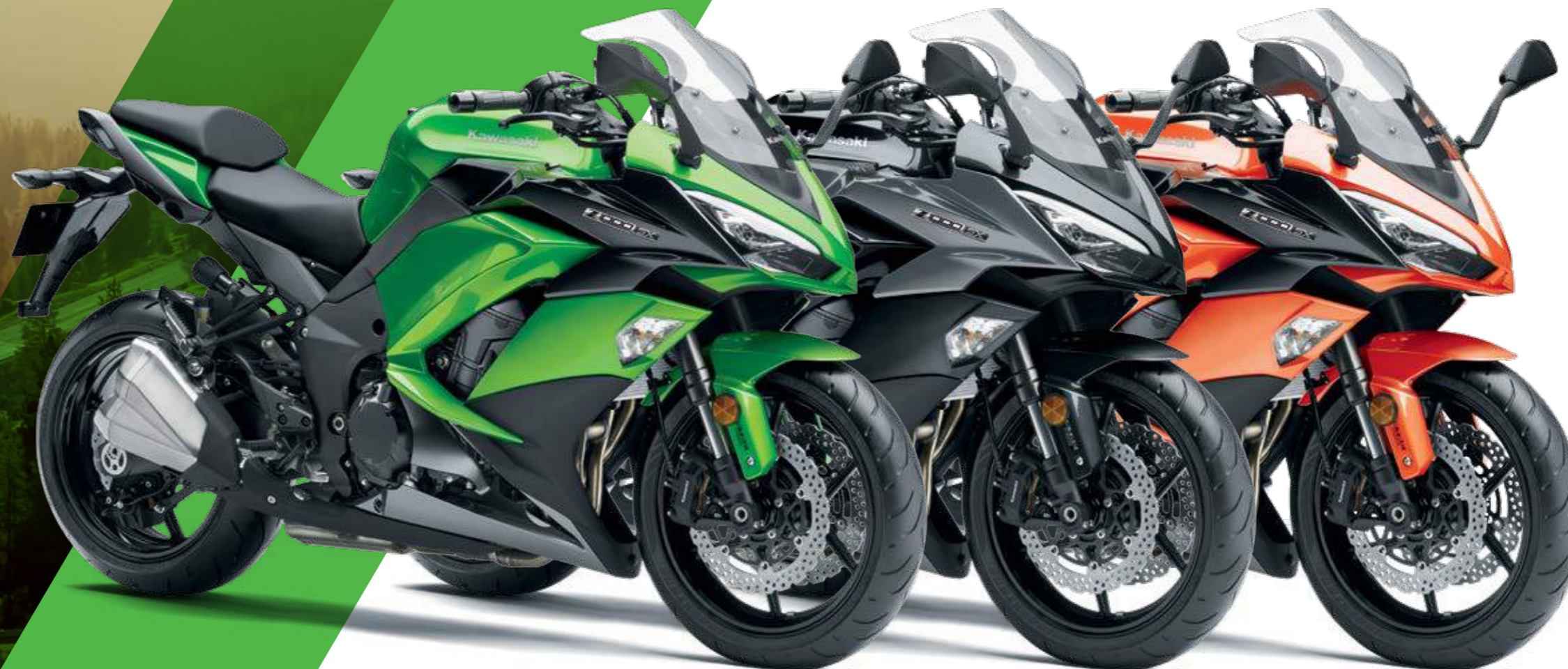
CANDY LIME GREEN / METALLIC CARBON GRAY