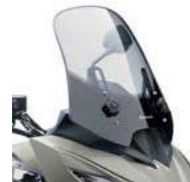
SMOKE SCREEN HIGH