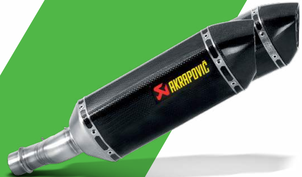
AKRAPOVIČ CARBON OR TITANIUM SILENCERS