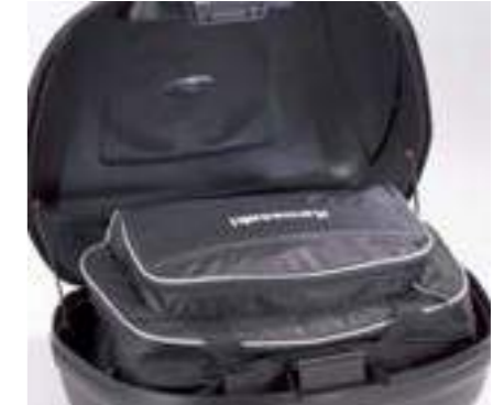
INNER BAG TOP CASE