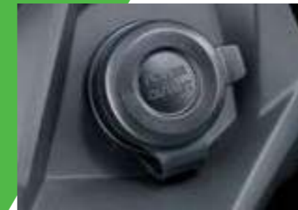
12V POWER OUTLET