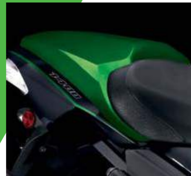
PILLION SEAT COVER

ZZR1400 IS ALSO AVAILABLE WITH A PERFORMANCE ACCESSORY PACKAGE THAT INCLUDES: • SMOKED SPOILER SCREEN • AKRAPOVIČ TITANIUM SILENCERS • PILLION SEAT COVER • KNEE PADS