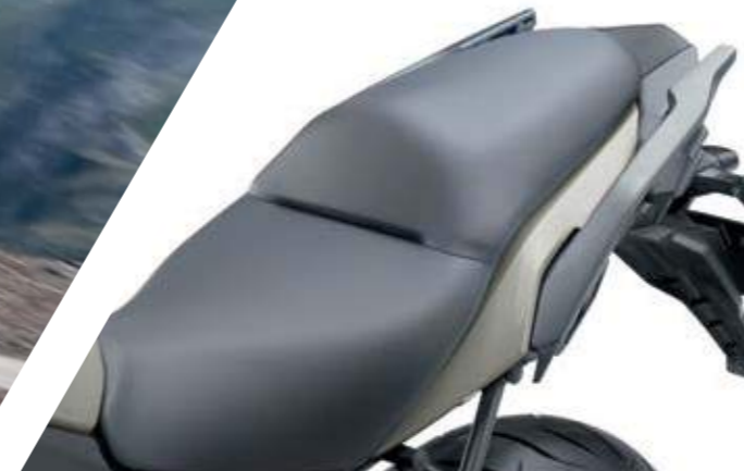
NATURAL PILLION SEATING POSITION