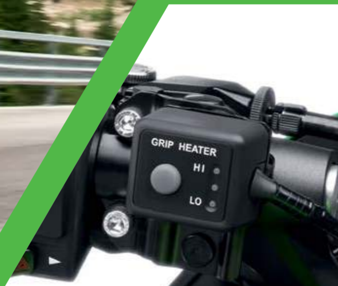
3-MODE GRIP HEATER