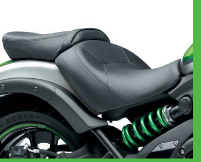
EXTENDED OR REDUCED REACH SEAT