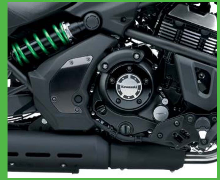
CLUTCH COVER PLATE