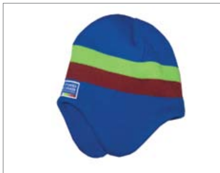
Knitted Winter Hat

Country of Origin: China Composition: 100% Polyester Microfibre Material weight: N/A